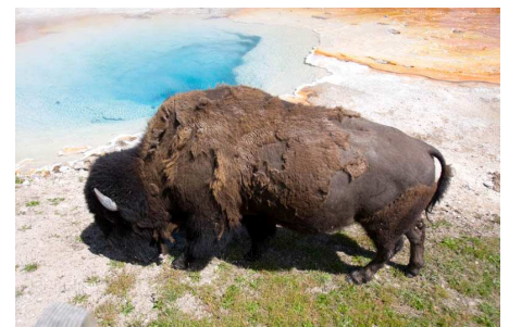
Yellowstone Tourist Attraction