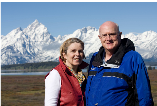
The Dynamic Duo in Grand Teton National Park.