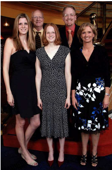
The proud papa with his progeny!

Our big trip of the year was a 65-day cruise on the MS Amsterdam. We left from Seattle on Sept. 19 th and returned to San Diego in November 23 rd after logging 23,861 miles – not counting walks to the buffet and dining room. Our stops included Japan, China, Vietnam, Thailand, Singapore, Bali, Australia, New Caledonia, Fiji, and Samoa. We had a splendid time, played a lot of trivia, made some new friends, and got reacquainted with some old friends from previous cruises. There are far too many pictures and too much description to include here, but take a look on our web site ( www.brownransomfamily.org ) for all the details and lots more pictures. I took 955 pictures, but winnowed them down to about 150 for the website. Better yet, come for a visit and we will give you a personal show-