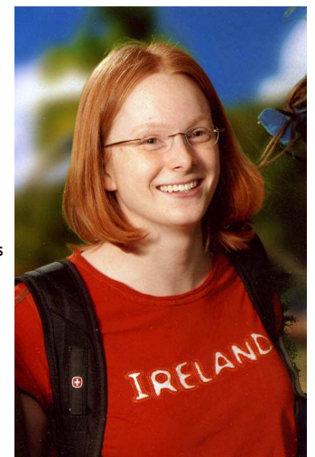
Captain of the Irish Women's Soccer Team

I was able to get away for a short vacation to the Olympic Peninsula in Washington State. Four beautiful days, one on a lakeside in an old lodge, one on a cliff overlooking the Pacific Ocean and the last in a cabin at a natural hot spring resort tucked up in the mountains. No TVs, no cell-phone coverage and no work!